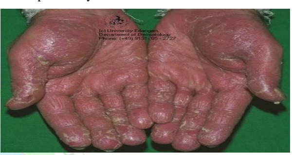
Figure 5: Erythrodermic Psoriasis

Involves extensive skin inflammation and eczema throughout the majority of the body's surface. Severe itching, swelling, and discomfort may accompany it. It's usually caused by an aggravation of unstable plaque psoriasis, especially when systemic medication is abruptly stopped. Extreme inflammation and exfoliation affect the body's capacity to regulate temperature and the skin's ability to conduct barrier functions, making this type of psoriasis potentially lethal<sup>7</sup>.