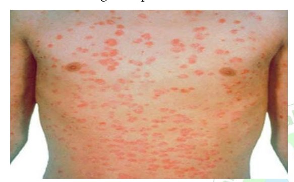
Figure 4: Guttate Psoriasis

Numerous little oval (teardrop-shaped) dots distinguish it. These psoriasis spots can be found all over the body, including the trunk, limbs, and scalp. Streptococcal throat infection is linked to guttate psoriasis.