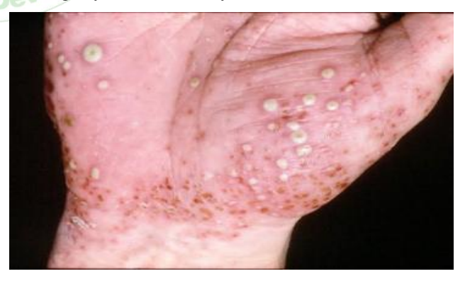
Figure 2: Pustular psoriasis

It manifests as elevated lumps packed with non-infectious pus (pustules). The skin beneath and around pustules is red and irritated. Pustular psoriasis can be localised, affecting primarily the hands and feet, or it can be widespread, affecting any area of the body.