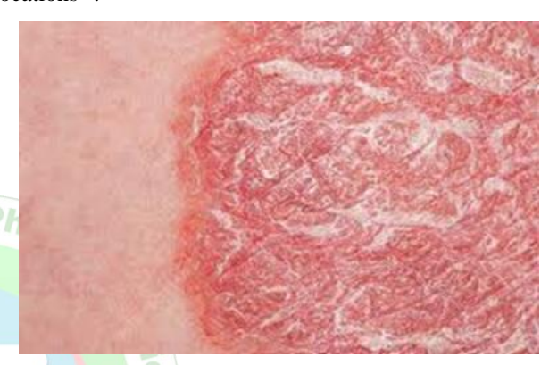
Figure 1: Plaque Psoriasis

silvery white scaly skin. Plaques are the names for these locations ^{15} .