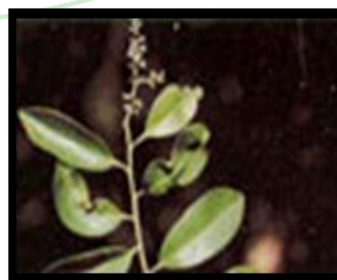
Figure 5:- Embelia Ribes

Synonyms - Vidanga Family - Myrsinceae Plant part - Root, fruit & leaves