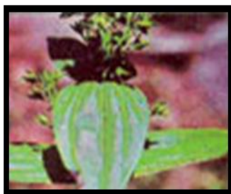
Figure 3:- SwertiaChiraita

Synonyms - Bunch Ham, Chirayaita Family - Gentnanaceae Plant part - Whole Plant