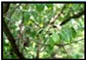
Figure 2:- Santalum Album

Synonyms - Indian sandal wood Family - Santaceae Plant part - Heart wood, oil