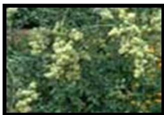
Figure 6:- Lawsenniaiermis