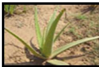
Figure 7:- Aloe Verra