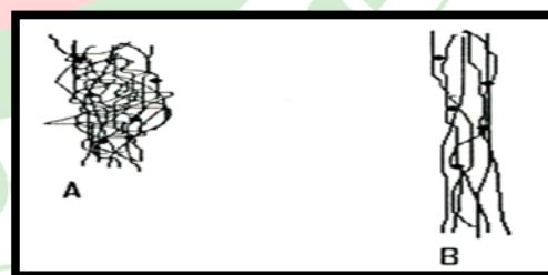
Figure:-1 Synthetic Elastomer

Rubbers (e.g. styrene-butadiene rubber, butyl rubber, polyisobutylene).