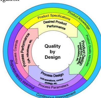
Figure 1: Quality by Design model